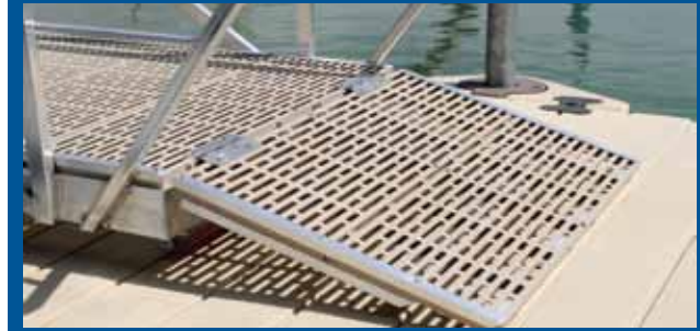
ROLLER / TRANSITION PLATE